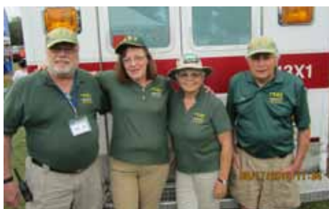
August 16-17, Timberman Triathlon, Gilford

Anyone who has participated in Emergency Response, whether military or civilian, knows that there may be long periods of inactivity, but that readiness and training must go on. Our LR-CERT is unusual in that we don't work scheduled shifts. We are on call 24/7 unless we've notified the team otherwise. One important mission (between "the Big Ones") is to help out our communities with traffic control for public events, first responder support for training exercises, and just being visible to present our message of emergency preparedness and to recruit potential new members. With about 30 active members, we are available to a recently expanded area of 18 cities and towns in the Lakes Region. We take pride in being responsive, helpful, and, above all, professional in the services we provide.