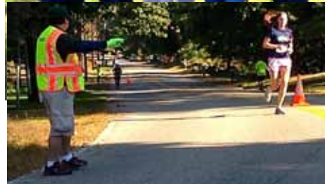
August 27, WOW Trail 5K Race, Laconia