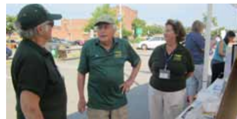
September 6, Laconia Multicultural Day

October 11-13, once again this year we directed handicap parking at the Sandwich Fair.