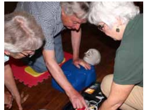
May 21, CPR/AED recertification.