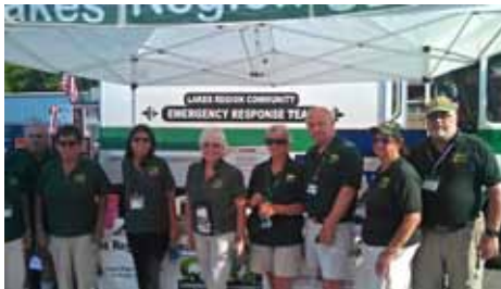
August 5, National Night Out for Safety, Laconia Police Department.